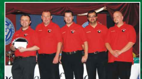
Woadman Arms - Plate Winners 2009